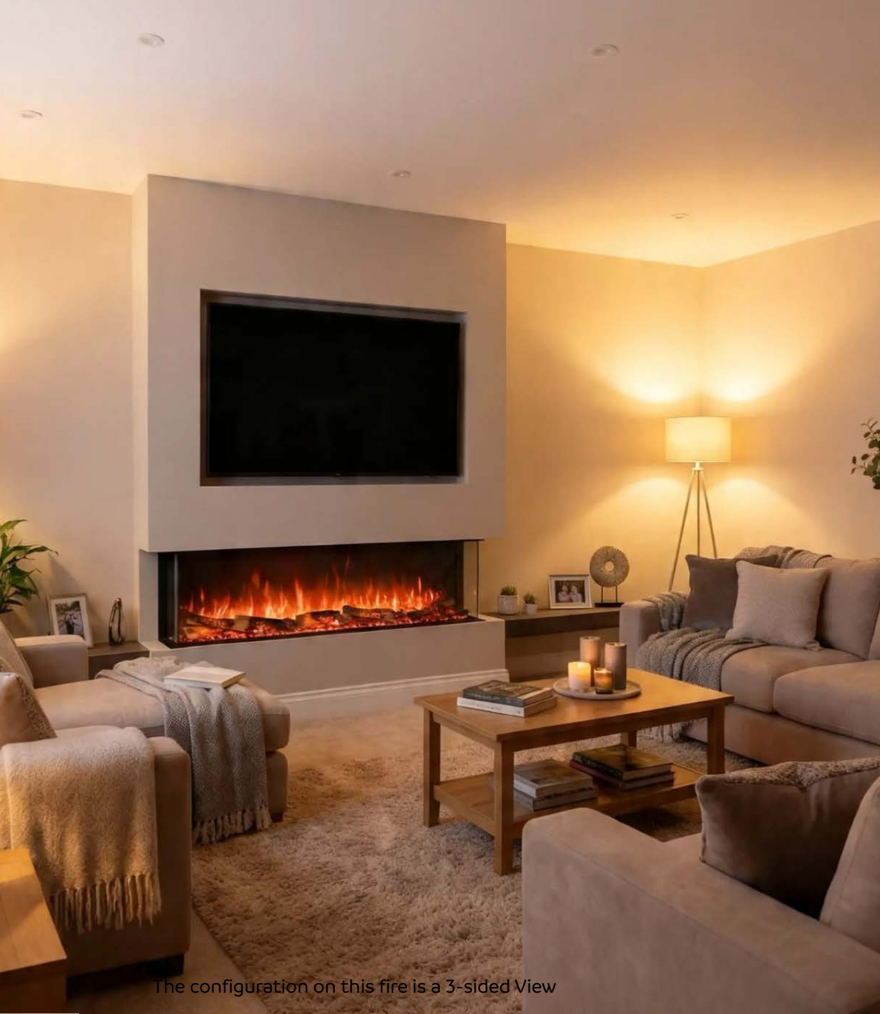
The configuration on this fire is a 3-sided View